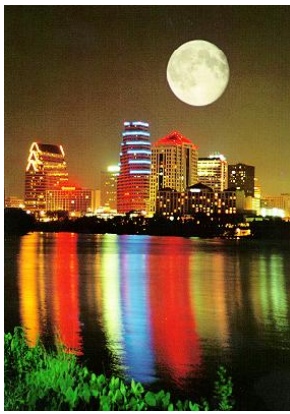
One Fabulous Skyline